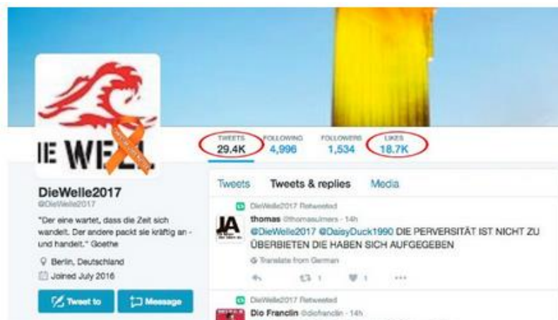
Twitter account @ diewelle2017

Look at the example below. “DieWelle2017” was created in July 2016, but already reached the amount of 30,000 posts.